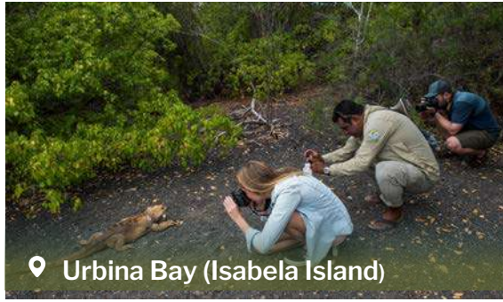
📍 Urbina Bay (Isabela Island)

At the far end of a long level hike, we arrive at a strange phenomenon where large blocks of coral lie completely exposed after a dramatic geological uplift in 1954. Located at the western base of Alcedo Volcano, we hope to run into a few impressive land iguanas and some volcanoes endemic to Galapagos giant tortoises during the wet season