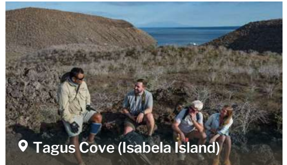
📍 Tagus Cove (Isabela Island)

Tagus Cove, a historic pirate hideout and anchorage. Visited by Charles Darwin and the HMS Beagle in 1835. Hike past Darwin Lake and stunning volcanic landscape, revealing Isabela island's dramatic northern volcanoes. Snorkel along a submerged wall with turtles, fish, penguins, and flightless cormorants. Enjoy a panga ride or kayak for added excitement!