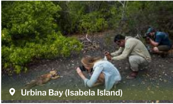
📍 Urbina Bay (Isabela Island)

At the far end of a long level hike, we arrive at a strange phenomenon where large blocks of coral lie completely exposed after a dramatic geological uplift in 1954. Located at the western base of Alcedo Volcano, we hope to run into a few impressive land iguanas and some volcanoes endemic to Galapagos giant tortoises during the wet season