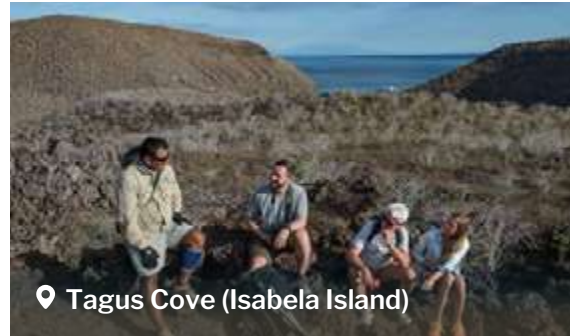
📍 Tagus Cove (Isabela Island)

Tagus Cove, a historic pirate hideout and anchorage. Visited by Charles Darwin and the HMS Beagle in 1835. Hike past Darwin Lake and stunning volcanic landscape, revealing Isabela island's dramatic northern volcanoes. Snorkel along a submerged wall with turtles, fish, penguins, and flightless cormorants. Enjoy a panga ride or kayak for added excitement!